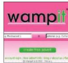
Listings: The website